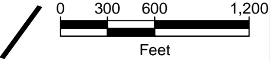
Exhibit 6 Briar Branch Drainage Study Drainage Problems Survey Results