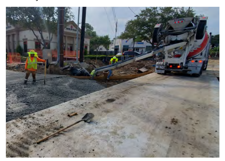
Driveway Concrete Pour