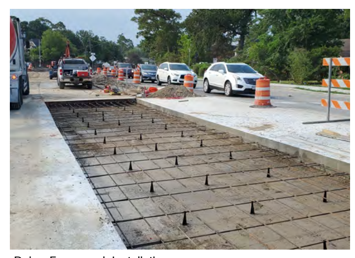
Rebar Framework Installation