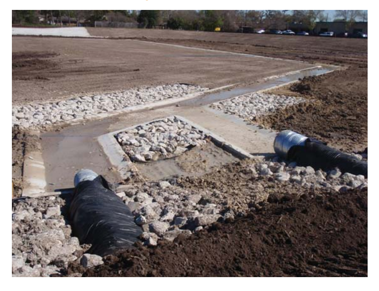
Phase II - 24" back slope drain and 36" storm sewer outfall