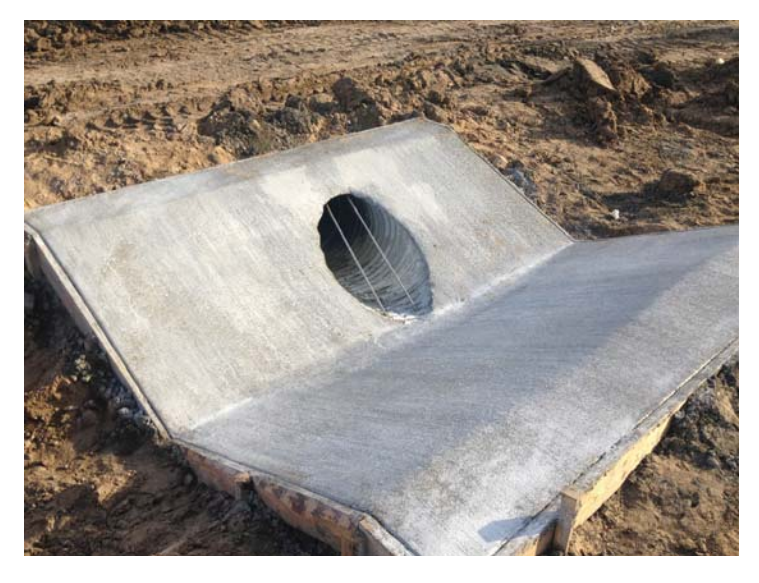
Phase II - Back slope interceptor structure with 24" outlet.