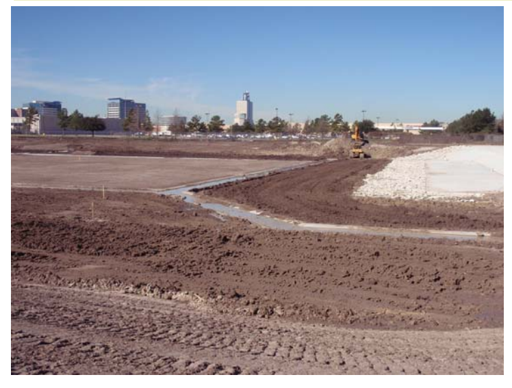
Phase II - Spreading topsoil.