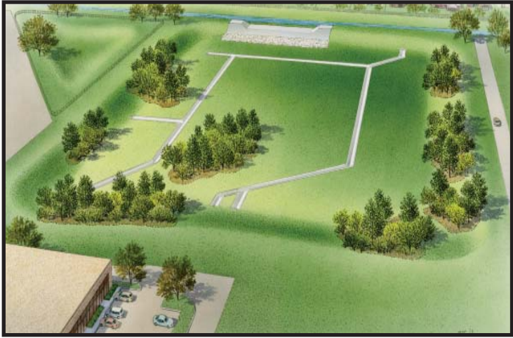
The final project as designed and constructed may vary from the depiction.