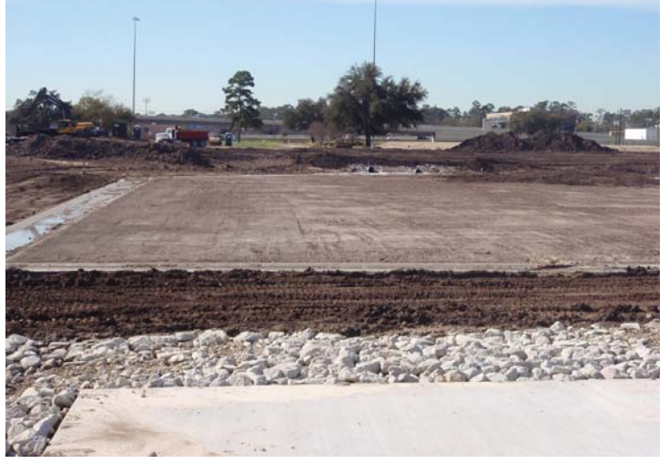
Phase II - Completing excavation at SE Corner.