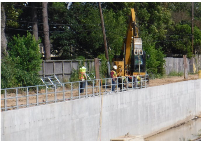
Rail installation on access road — Phase I