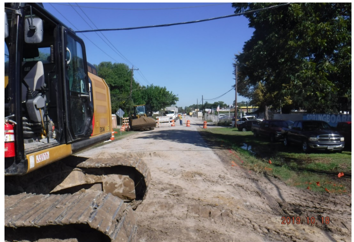
Road closure at Witte Rd in preparation for water line lowering