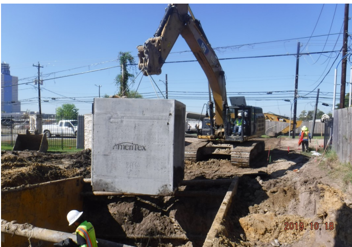
RCB installation — Phase II