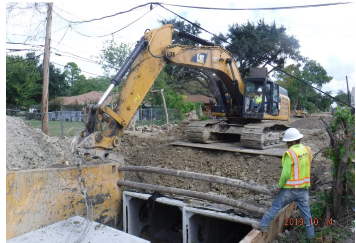
RCB installation under low hanging line — Phase II