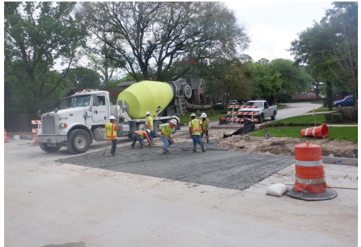
Concrete pour on Windhover lane