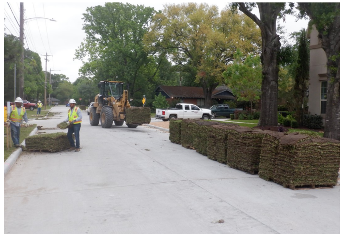
Sod installation on Windhover Lane (Straw 4)