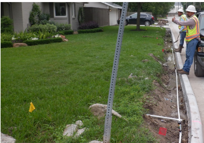
Sprinkler system repair completed Windhover Lane (Straw 4).