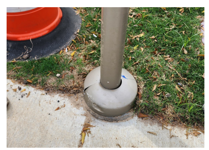
Included on punch list items to be fixed.