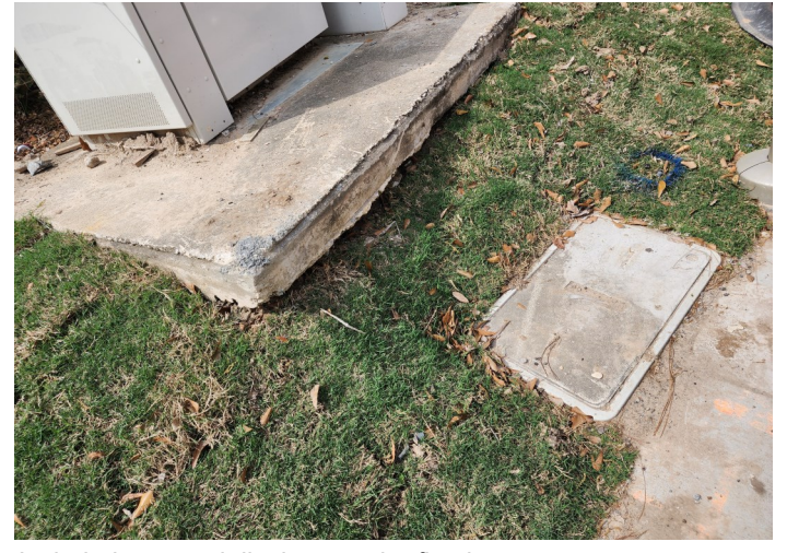
Included on punch list items to be fixed.