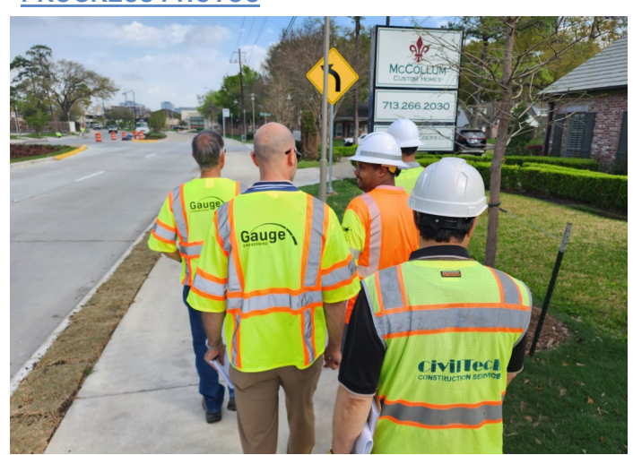
TxDOT, City, TIRZ 17, CM and Gauge personnel.