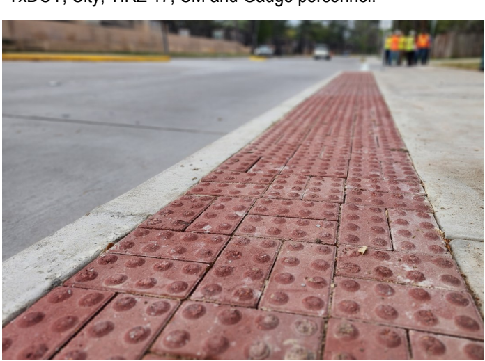
BOOST level improvements at Bus Stop.