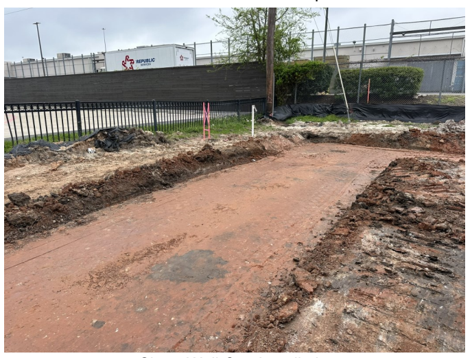
Slurry Wall Cap Installation