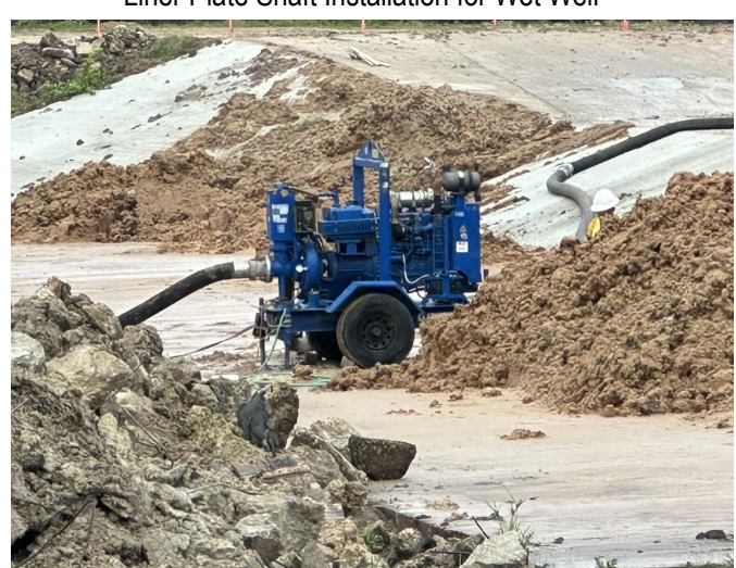
Pump for Ground Water Control