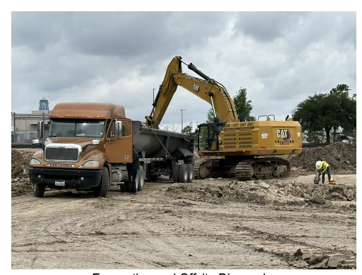
Excavation and Offsite Disposal