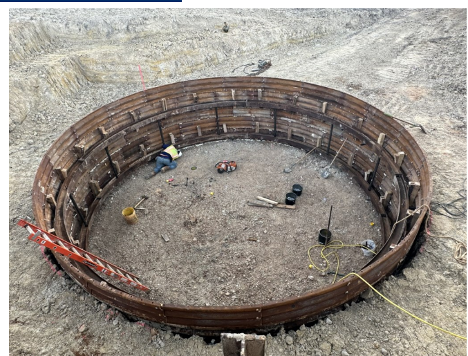
Liner Plate Shaft Installation for Wet Well